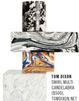
TOM DIXON SWIRL MULTI CANDELABRA ($500), TOMDIXON.NET

Objets d'art for the collector whose walls are filled with museum-worthy works but whose shelves can fit at least one more thing.