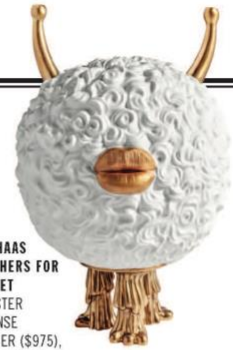
THE HAAS BROTHERS FOR L'OBJET MONSTER INCENSE BURNER ($975), L-OBJET.COM