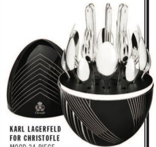
KARL LAGERFELD FOR CHRISTOFLE MOOD 24-PIECE FLATWARE SET ($3,500), CHRISTOFLE.COM