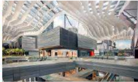
Brickell City Centre brings 14 brands to the U.S. for the first time