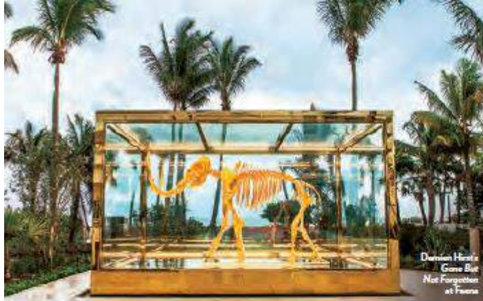
Damien Hirst's Gold Bone Not Forgotten at Faena

basement, a vibrant nightclub featuring not only a bowling alley but also an (original) ice-skating rink.