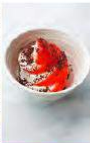
California Dreamado (watermelon yogurt soft serve, cocoa crumbs, white chocolate pearls) at Upland

Less about massive clubs than it was in the past, South Beach has a new crop of bars. Jezebel Bar + Kitchen is a cozy lounge just off Lincoln Road that feels sophisticated on a Thursday night, but is casual enough to show NFL games on Sunday. A few blocks west, taco eatery Bodega has a hidden door that leads to a speak-easy-style space with potent drinks, while next door, comfort meets nostalgia at Ricky's , a lounge that attracts an ebullient