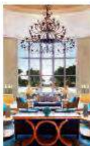
The Ritz-Carlton Key Biscayne lobby