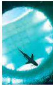
A shark swims in the Frost Science museum's 500,000-gallon Giff Stream aquarium

Ten years ago, Downtown Miami was known for its sooty electronics shops and jewelry brokers. Now all that has changed, thanks to big leaps in culture, condos and cuisine. The most significant boon to Downtown is the completion of Museum Park , which is home to the stunning Pérez Art Museum Miami (PAMM) and the brand-new Frost Science museum, which completes a constellation of walking-distance cultural hubs, including the Adrienne Arsht Center for the Performing Arts . PAMM is worth a visit, not only for the art, but also for the beautiful Herzog & de Meuron design, which incorporates a broad museum "front porch" looking