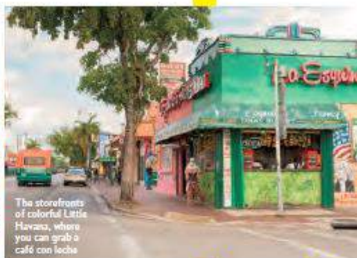
The storefronts of colorful Little Havana, where you can grab a café con leche

Once a hippie enclave in the 1980s, Coconut Grove is a quaint tree-lined area with a new pep in its step. Skip the de rigueur mallish spots and instead shoe hunt for Balenciaga and Attico at the chic boutique The Griffin or spy jet-setter-themed luggage and other