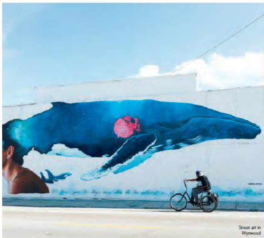
Street art in Wynwood

are also four breweries in the district, the most recent of which is Veza Sur Brewing Co. , opening this year as a grown-up's playground teeming with beer cocktails and brews served Brazilian "chopp" style. For a more intimate atmosphere, head to micro-brew specialist Boxelder's dimly lit L-shaped bar. Gramps' tropical dive aesthetic lures the tattooed and skinny jean crowd with weekly drag queen bingo and karaoke nights.