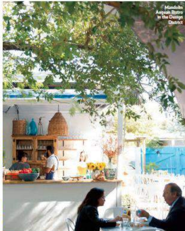
Mandolin Aegean Bistro in the Design District

The food scene has taken flight—there were four James Beard semifinalists within three blocks of each other this year.