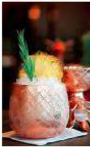
The vodka-based Penasoplo cocktail at Matador Room

In pleasantly removed Surfside, just north of the Miami Beach border, Four Seasons The Surf Club has beautifully restored a 1930 Mediterranean Revival structure, which houses an outpost of Le Sirenuse , the iconic dining haunt on Italy's Amalfi Coast (don't miss the restaurant's exquisite Champagne Bar ), as well as an upcoming restaurant from culinary superstar Thomas Keller, set to open in 2018. Guests retire to sleek towers designed by Pritzker Prize-winner Richard Meier.