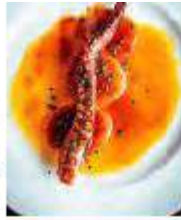
Octopus a la plancha at Quinto La Huella

Brickell's building boom continues to the south at SLS Brickell , a condo-hotel hybrid with Philippe Stark design and restaurants by a pair of James Beard award-winning chefs, José Andrés at Bazaar Mar and Michael Schwartz at FYBa . For late-night fun and over-the-top dining, hit Komodo , the swanky Southeast Asian multi-level space owned by famed