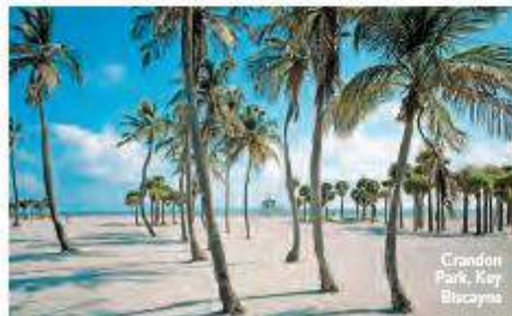
Crandon Park, Key Biscayne

Get the best rates on flights, hotels, cars and more when you book your trip with American Airlines Vacations . Plus, earn bonus miles on all vacation packages. aa.vacations.com