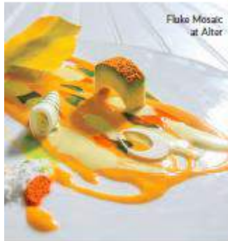
Fluke Mosaic at Alter

Plaza. And it's not just retail. The Design District's Institute of Contemporary Art reopens next month in swanky new digs with pieces from legends like Picasso and emerging contemporary artists such as Abigail DeVille. Galleries, including non-profit Locust Projects and the street-artist-friendly Primary Projects are