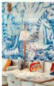
Whimsical nautical decor at José Andrés' Bazaar Mar