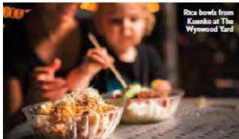
Rice bowls from Kusko at The Wynwood Yard