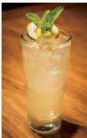
Cucumber Mint Collins at Jezebel Kitchen + Bar