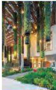
PAMM's hanging gardens facing Biscayne Bay