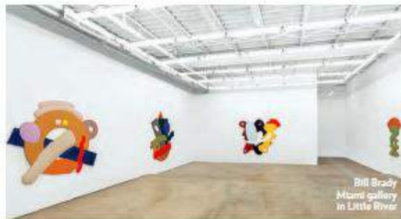
Bill Brady Miami gallery in Little River