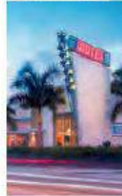
The Vagabond Hotels reunite rooftop celebs MiMo architecture