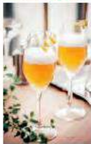
Lupa 35 cocktail at SLS Brickell's FYBa