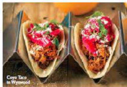
Coyo Taco in Wynwood