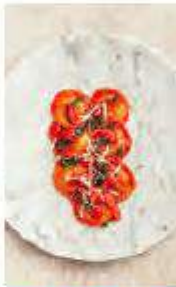
Ravioli with smoked mozzarella, Pachino tomato and basil at Forté del Marmi

A decade ago, Mid Beach (from 23rd Street to 41st Street) was an afterthought. Ian Schrager's buzzy Edition hotel energized the area with the Spanish/Caribbean-flavored Matador Room and the more casual Market , which sends out deceptively simple dishes such as burrata with Meyer lemon jam and pizza with black truffle and fontina. Looking for after-dark high jinks? Hit the property's