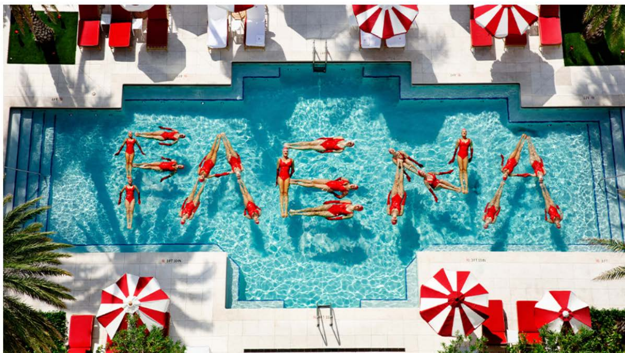
Embrace the Miami Beach heat from Faena’s palm-fringed pool.

Sprawled along a swath of white sand and turquoise waters, Faena Hotel Miami Beach pops with its cherry-red-and-white-patterned umbrellas. And while the ocean steals the spotlight at most beachfront hotels, there’s much more to see here. Every corner of the Forbes Travel Guide Five-Star hotel’s six-block art district showcases bold design, striking art and over-the-top glamour that looks straight out of a Baz Luhrmann movie (it’s because the famed director and his set designer/costumer wife, Catherine Martin, were creative consultants at the property).