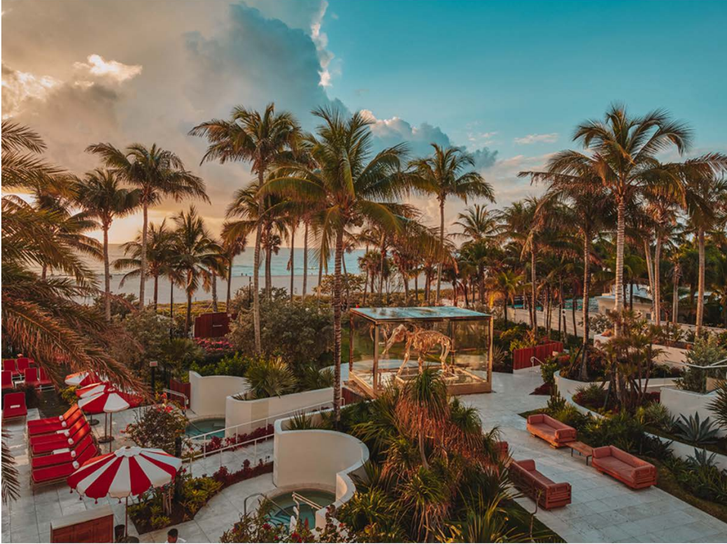
Faena's most famous artwork, English artist Damien Hirst's Gone But Not Forgotten, sits outside in a vitrine. The extraordinary nearly 10-foot-tall gilded woolly mammoth skeleton makes you consider life and death, myth and legend, and evolution and science.